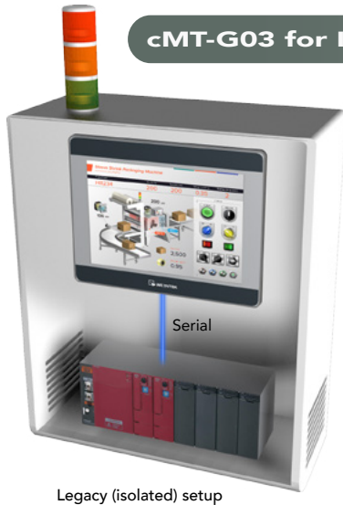
Legacy (isolated) setup

A transparent serial bridge on the Weintek cMT-G03 gateway enables updating legacy machines without modifying any code on the existing panel or controller. This makes it easy to get machine data on the former without the trouble of reconfiguring machine communications. Plus it enhances data security.